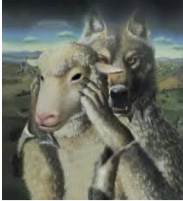
BEHIND A MASK