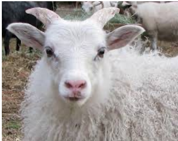
LOOKS LIKE A LAMB