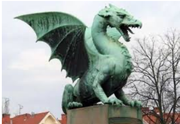
SPEAKS THE WORDS OF THE DRAGON: SATAN